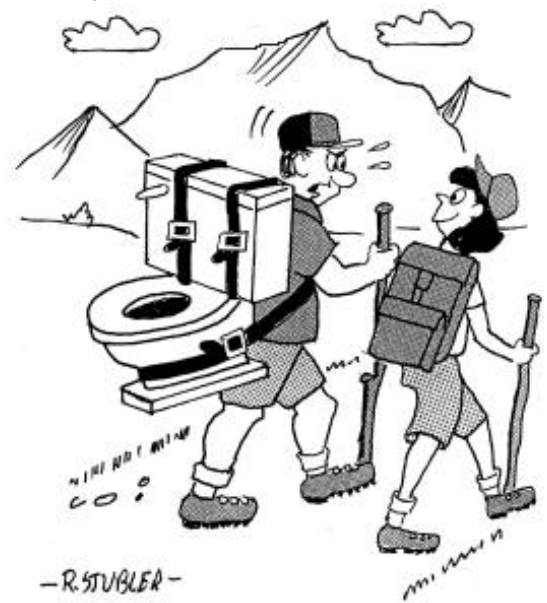
"I'LL NEVER TAKE YOU BACKPACKING AGAIN."

ready to check off on their Tenderfoot, Second Class, or First Class requirements. We have several older Scouts and adults in attendance that can accommodate them. Participation in Troop outings can help as advancement opportunities are built into these events. Some activities the Troop has planned do have a rank requirement and working on advancement continuously will help ensure the scout's ability to participate. The key point is that the Scout must want to advance. We provide the opportunities for advancement; the Scout must take the initiative.